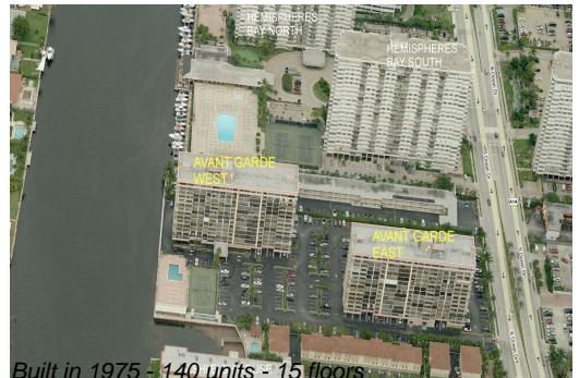
Built in 1975 - 140 units - 15 floors