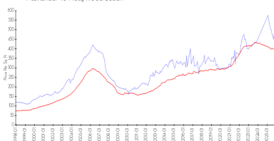
Alexander vs Hollywood Beach