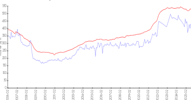
Nu River Landing vs Fort Lauderdale