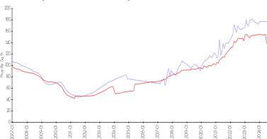
Jennings Point at Oakleaf vs Orange Park