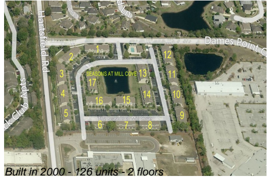
Built in 2000 - 126 units - 2 floors