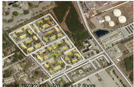
Built in 1970/2005 - 320 units - 2 floors