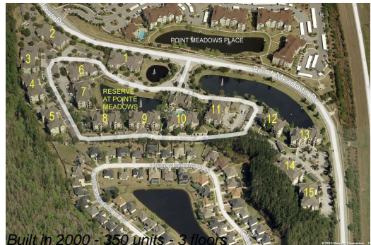
Built in 2000 - 350 units - 3 floors