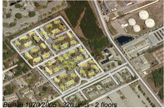
Built in 1970/2005 - 320 units - 2 floors