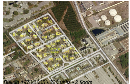
Built in 1970/2005 - 320 units - 2 floors