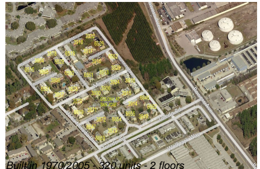
Built in 1970/2005 - 320 units - 2 floors