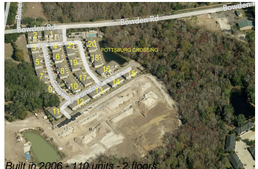
Built in 2006 - 110 units - 2 floors