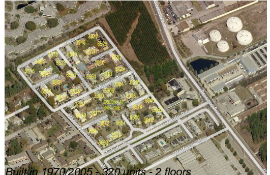
Built in 1970/2005 - 320 units - 2 floors