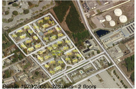
Built in 1970/2005 - 320 units - 2 floors