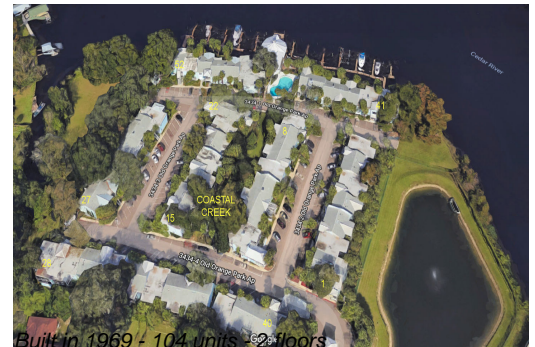
Built in 1969 - 104 units - 2 floors