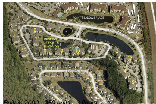
Built in 2000 - 350 units - 3 floors