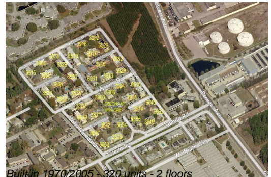
Built in 1970/2005 - 320 units - 2 floors