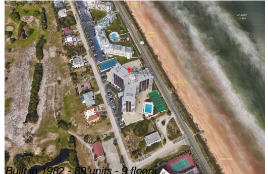
Built in 1982 - 89 units - 9 floors