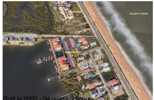
Built in 2000 - 54 units - 3 floors