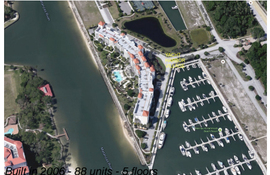
Built in 2006 - 88 units - 5 floors