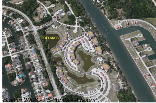
Built in 2006 - 252 units - 4 floors