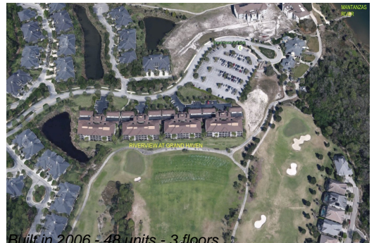
Built in 2006 - 48 units - 3 floors