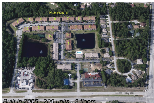
Built in 2005 - 200 units - 2 floors