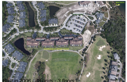
Built in 2006 - 48 units - 3 floors