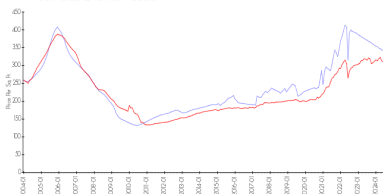
Surf Club II vs Palm Coast