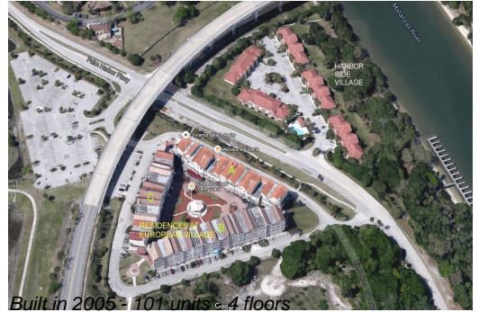
Built in 2005 - 101 units - 4 floors