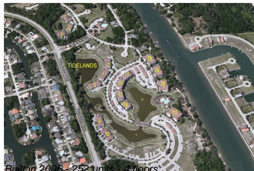
Built in 2006 - 252 units - 6 floors