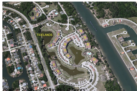
Built in 2006 - 252 units - 6 floors