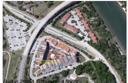
Built in 2005 - 101 units - 4 floors