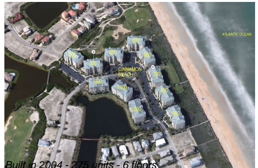
Built in 2004 - 275 units - 6 floors