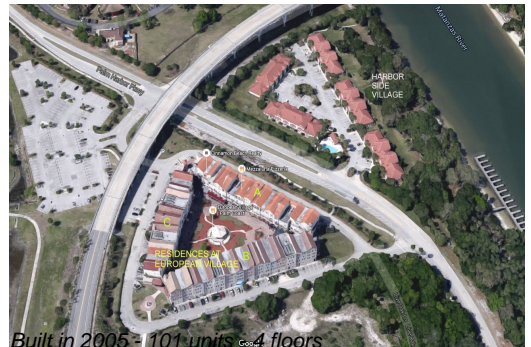
Built in 2005 - 101 units - 4 floors