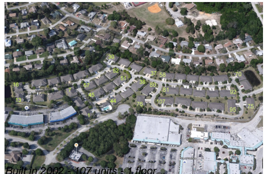
Built in 2002 - 107 units - 1 floor