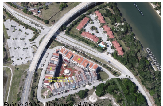
Built in 2005 - 101 units - 4 floors