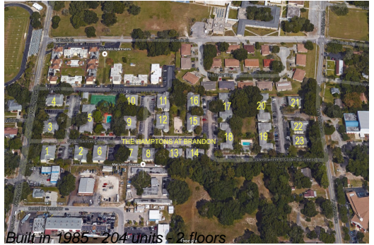
Built in 1985 - 204 units - 2 floors