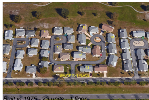
Built in 1975 - 23 units - 1 floor