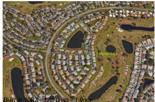
Built in 1987 - 170 units - 4 floor