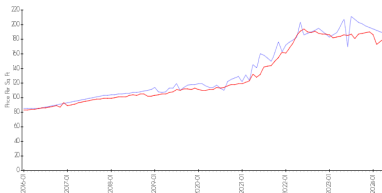
Regency Key vs Brandon