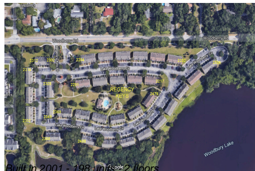
Built in 2001 - 198 units 2 floors