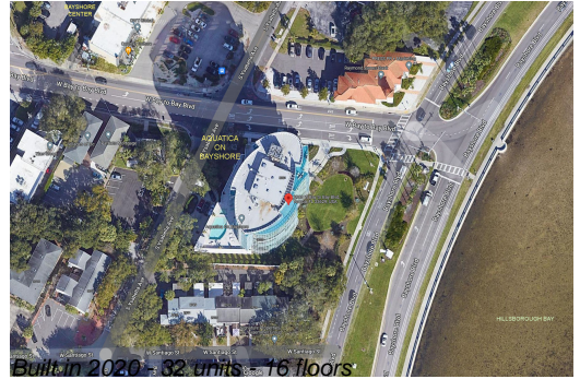
Built in 2020 - 32 units - 16 floors