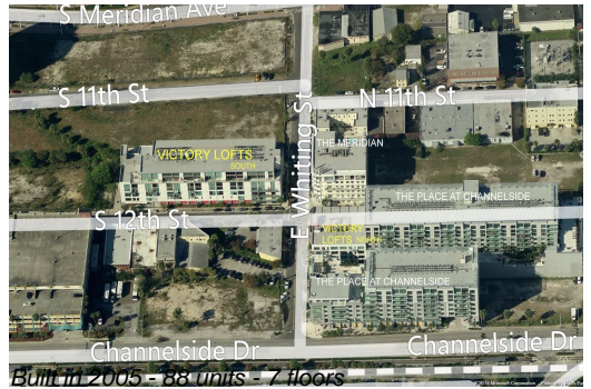
Build in 2005 - 88 units - 7 floors