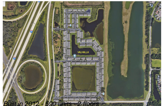
Built in 2012 - 590 units - 2 floors