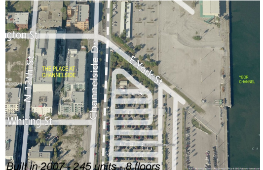
Built in 2007 - 245 units - 8 floors