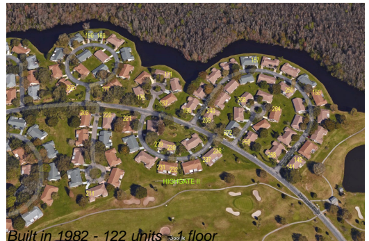
Built in 1982 - 122 units - 1 floor