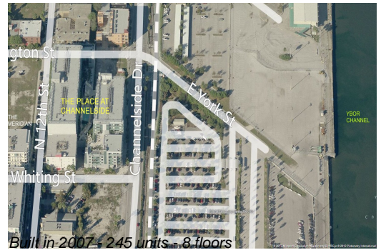
Built in 2007 - 245 units - 8 floors