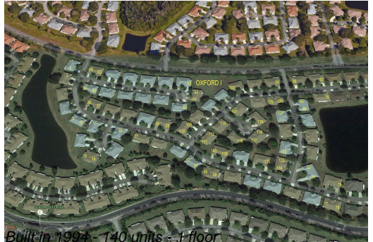
Built in 1994 - 140 units - 1 floor