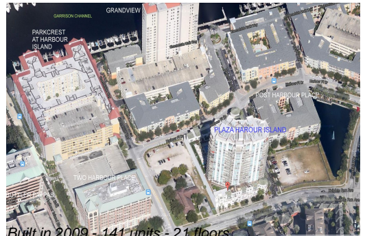
Built in 2009 - 141 units - 21 floors