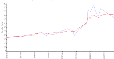
Falls at New Tampa (1-12) vs Temple Terrace