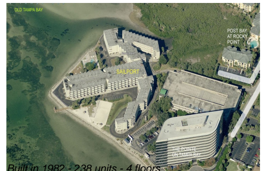
Built in 1982 - 238 units - 4 floors