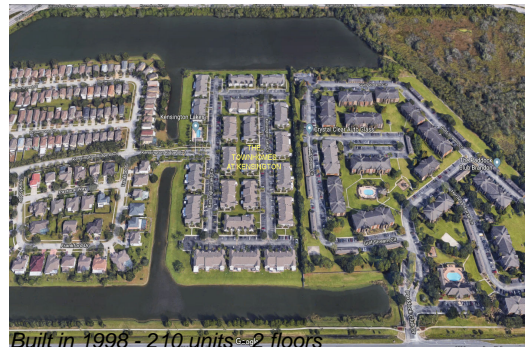
Built in 1998 - 210 units - 2 floors