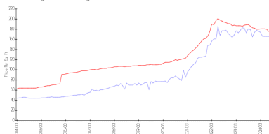
Villages of Bloomingdale vs Riverview