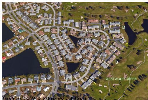
Built in 1976 - 70 units - 654,000 sq ft