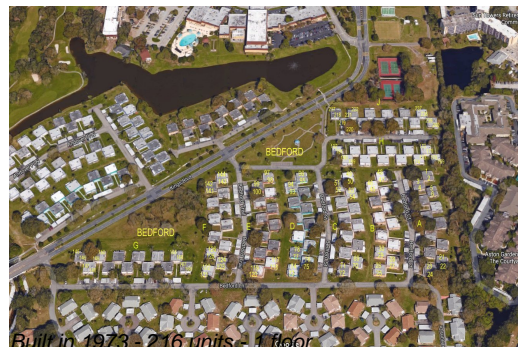
Built in 1973 - 216 units - 1 floor