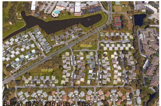
Built in 1973 - 216 units - 1 floor